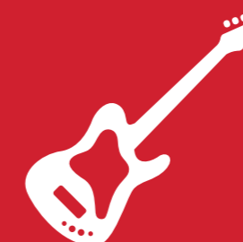
Guitar and keyboards